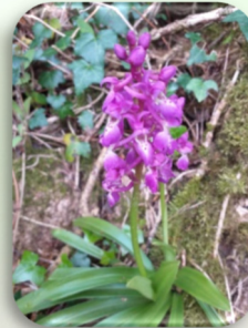
EARLY PURPLE ORCHID